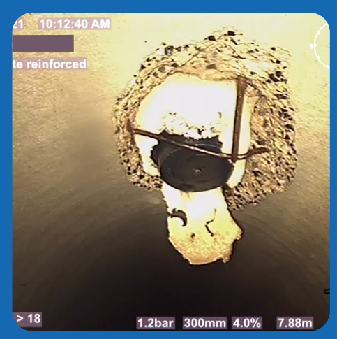
Defect identified for repair