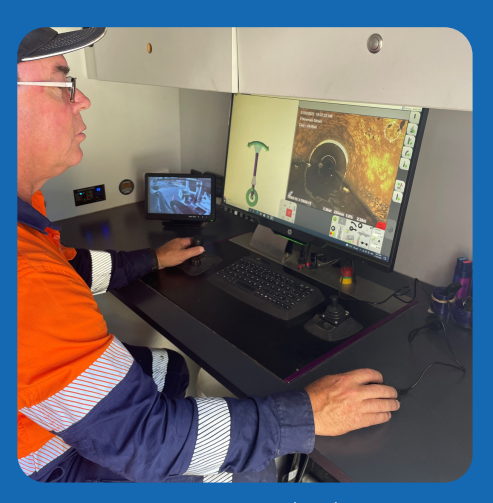
Expert CCTV technology

Delivered a cost-saving by re-capturing final condition assessment footage and not proceeding with some of the defect repairs where previous footage was inconclusive.